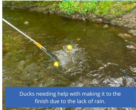
Ducks needing help with making it to the finish due to the lack of rain.

This year's duck race proved to be a challenge due to the lack of rain and the current of water poor. When the duck was released from under the bridge at Carriers Row the current was stronger from the tributary and wind just pushed the ducks backwards. Also, further down the eddies captured many ducks. Thanks to the volunteers that braved the water to help push the ducks along to the finish.